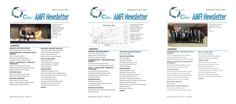
Fig. 1 AMF TCP Newsletters Published in 2017