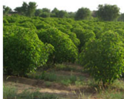
Jathropa curcas.

Jathropa is already planted in India with target to replace around 5% of its 40-million tonnes of annual diesel consumption. ( www.mozlegal.com ). Jathropa plantations exist also in other countries, like the Philippines, Thailand and African countries, e.g., Ghana and South-Africa. Sweden is going to use Jathropa in addition to tall oil in Piteå. Source: Miljöbilens värld, May 2007.