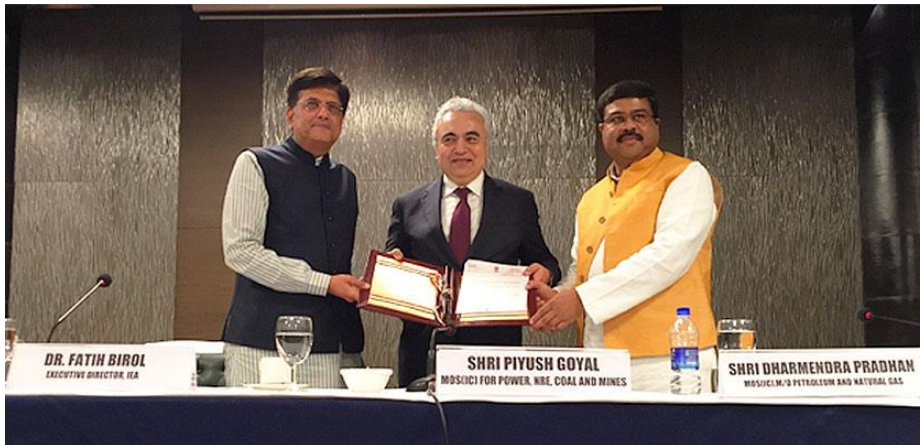
Dr Fatih Birol (centre) after joint press conference with Minister Goyal (left) and Minister Pradhan announcing activation of IEA Association